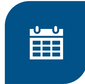
Exercise Planning Timeline